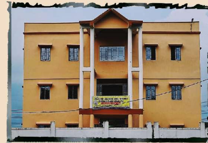
JAGADISH CHANDRA BASU SHIKSHAK SIKSHAN MAHAVIDYALAYA (B.ED., B.P.ED.)