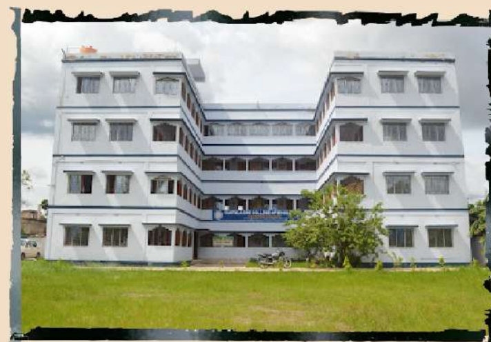
KUNTALA DAS COLLEGE OF EDUCATION (D.EL.ED. & B.ED.)