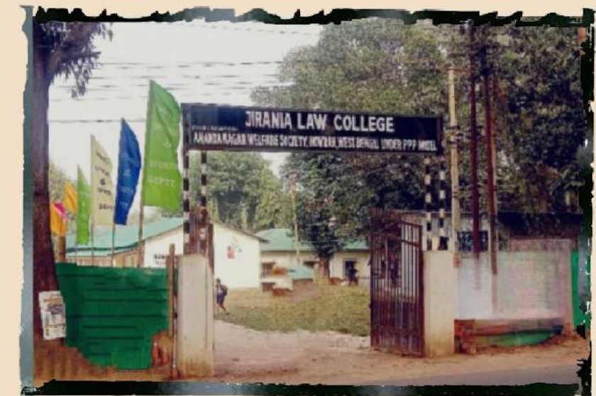
JIRANIA LAW COLLEGE TRIPURA