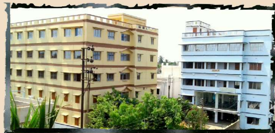
SURENDRALAL DAS TEACHERS' TRAINING COLLEGE (D.EL.ED., B.ED. & M.ED.)

Arya Sabhyata - The Group of Institutions dream to pave the way of the future generations and ensure them a secured learning environment.